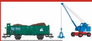
2015 HO Museum Car

The new Märklin Group owners saw the wisdom in once again offering the Museum Cars to the export market knowing that most will most likely never attend the factory museum, let alone on a yearly basis. Previous management could never make up their minds and this long celebrated program was cancelled on a number of occasions. We believe its back now for good. This year's models are 48115 in HO; in Z # 80026 and in 1 Gauge # 58475 . We will also be able to offer previous years shortly on our website for 2014; 2013; 2012 and perhaps even 2008?