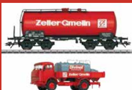
2016 HO Museum Car

Once again we plan on bringing a small assortment of the collectible museum cars from the Märklin Group. This year's museum cars are four axle privately owned tank cars car of Zeller + Gmelin GmbH & Co.KG, a petroleum oil refinery based in Eisingen/Fils. The HO model comes packaged in a model of oil barrel and includes a model of a tanker truck in the firm's livery. The Z scale car also includes a model of an older style tanker truck.